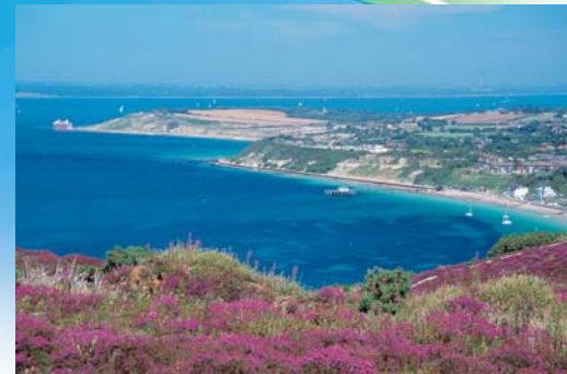
View of Totland Bay from Headon Warren